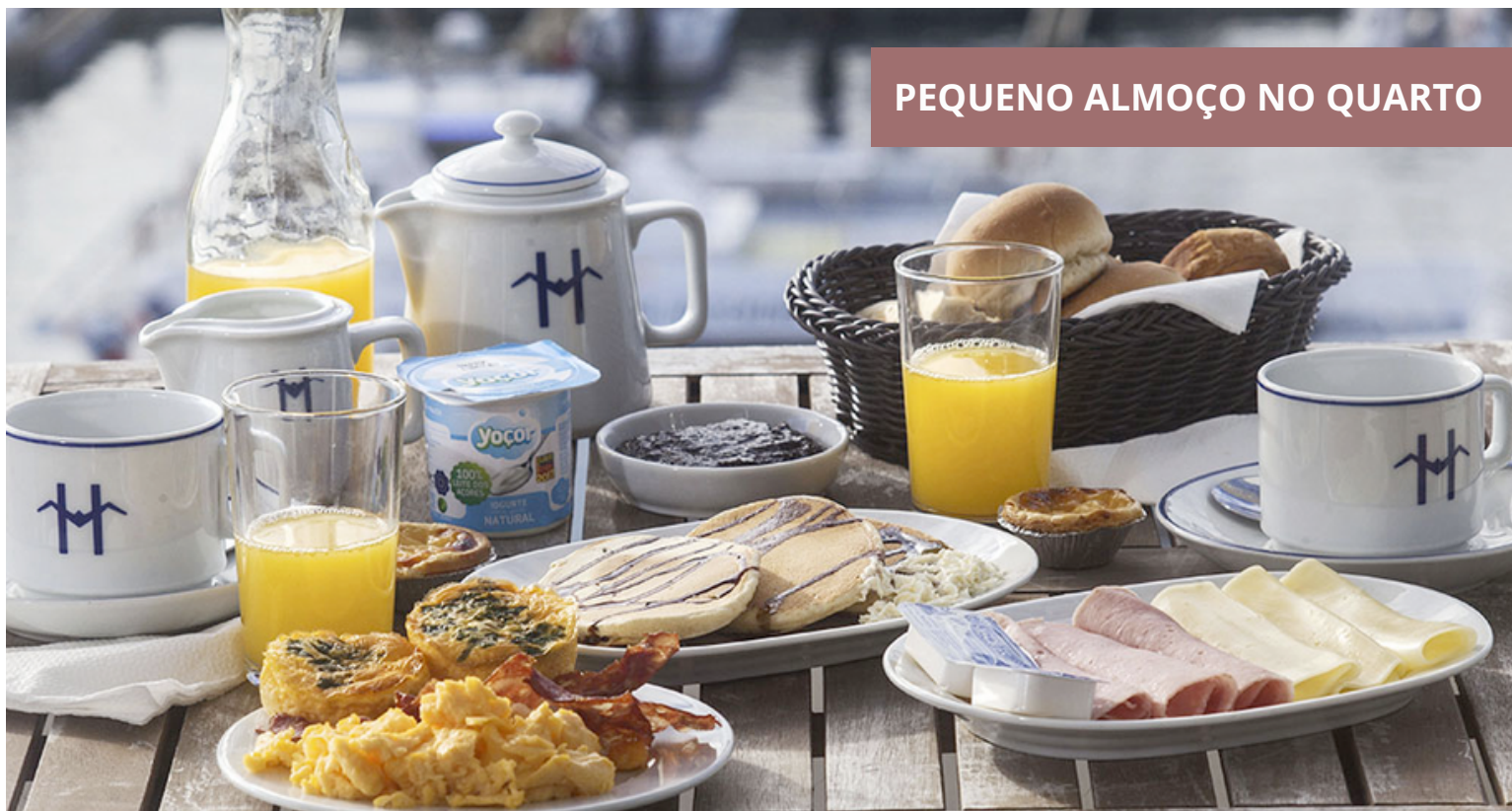
PEQUENO ALMOÇO NO QUARTO

Temos vários pacotes e opções à escolha do cliente. Para mais informações por favor contacte-nos ou visite o nosso site: www.hotelgavota.com