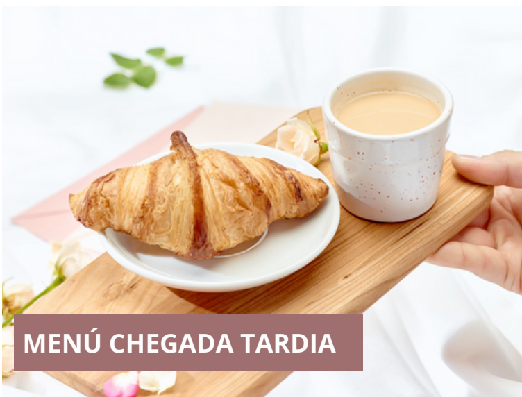
MENÚ CHEGADA TARDIA