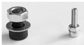
Figure 2. Task A and Task B

Figure A presents the two assemblies which included sets of nuts, bolts, and washers: a larger set (Task A), and a smaller set (Task B). The smaller set required greater dexterity, fine motor control, and precision, therefore it is expected greater levels of workload would be required.